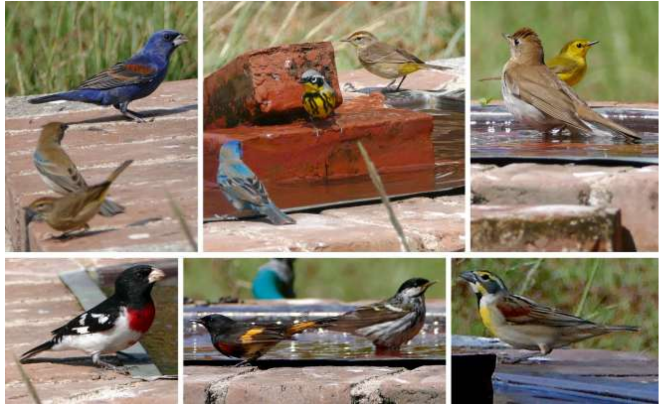
Many bird species including warblers, thrushes, buntings, and others visit the fountain regularly

Today, Fort Jefferson's massive walls provide refuge not to armies of men, but to hundreds of exhausted trans-Gulf migrants. Its shores are visited not by conquering armies from foreign lands, but by birders, naturalists, fishermen, and curious visitors. The trees within its grounds are sometimes teeming with songbirds. As many as twenty species of warblers may feed among the foliage, while mute Cattle Egrets stalk scarce prey below.