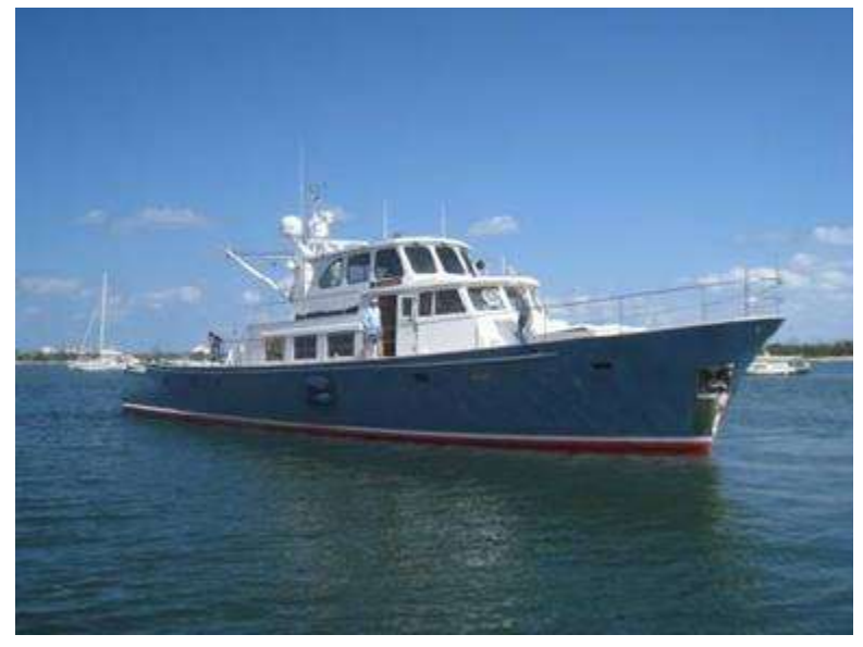
The M/V Makai

The dinghy runs often turn up interesting shorebirds, wading birds, waterfowl and even aquatic species such as sea turtles, sharks and American shorebirds, wading birds, waterfowl and even aquatic species such as sea turtles, and American Crocodile. This is often ranked as one of the most magical experiences of the tour, as we get personal with swarms of countless birds while the sun sets.