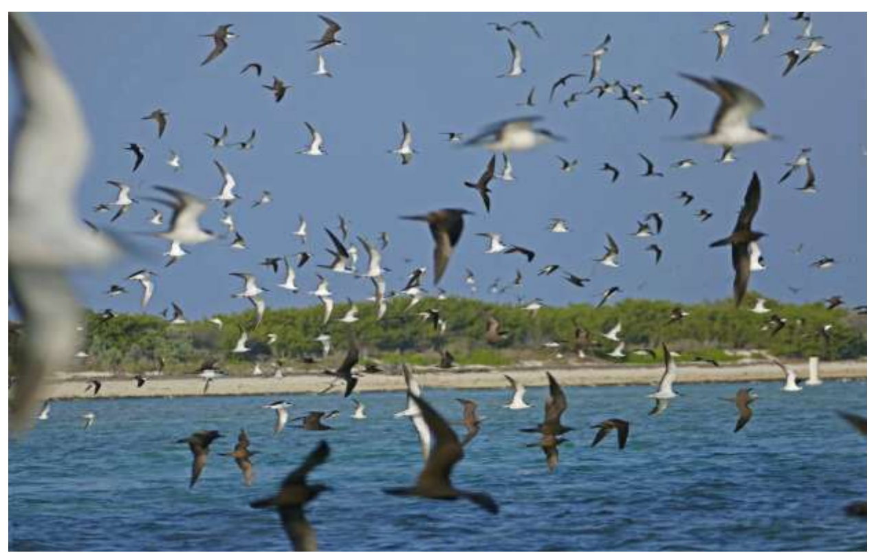
Sooty Terns and Brown Noddies streaming out of the colony at Bush Key

Next to Garden Key is the huge Sooty Tern colony on Bush Key. At first light, the colony is raucous, as thousands of birds become active. Along with Sooty Terns are a few thousand Brown Noddies and numbers of Brown Pelicans. The spectacle is simply awesome, as terns and noddies come and go endlessly, and we should be able to locate some recent hatchlings. Bush Key is the only nesting site in the United States for these two species.